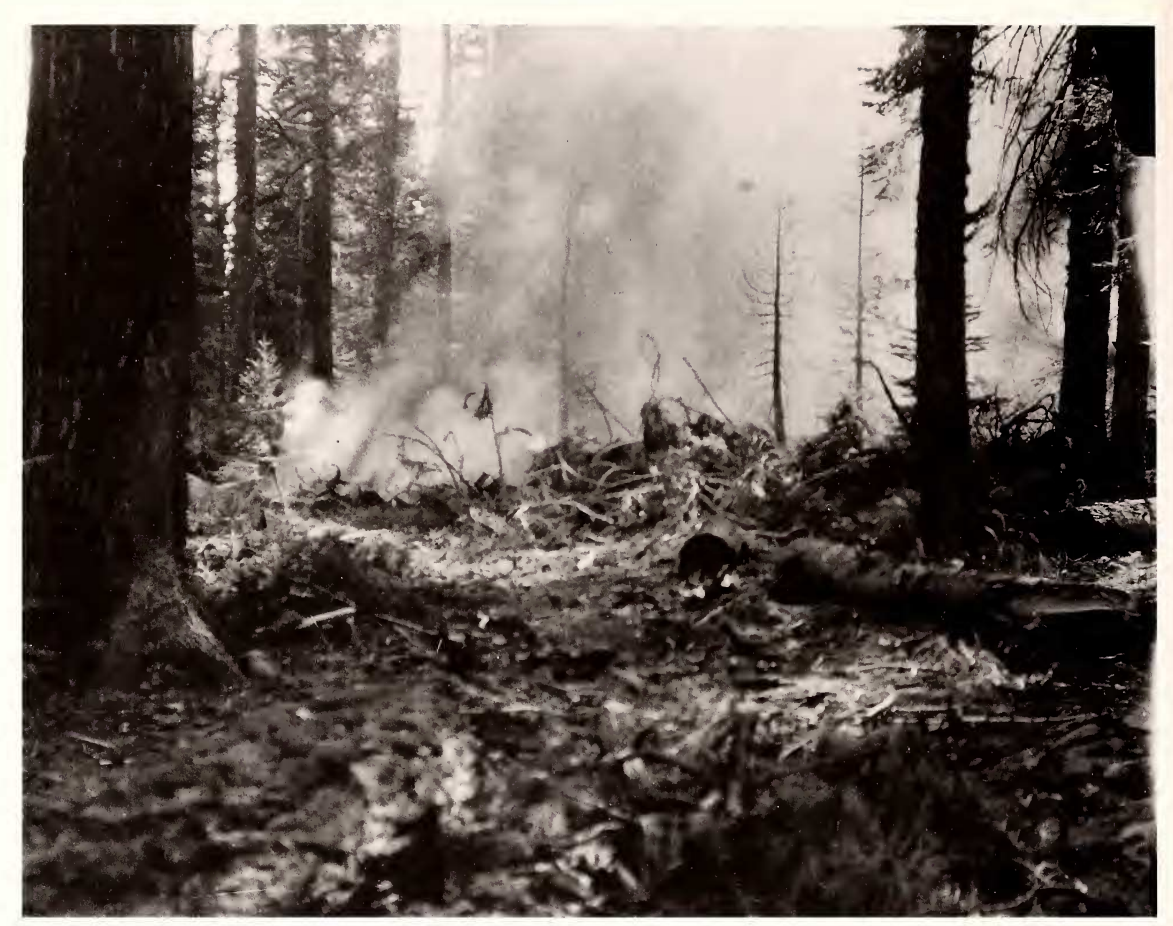
FIG. 2. Amador county, 1899. Near sawmill 5–6 km (3–4 miles) below dam on Bear River. Forest fire in fir and pine, killed all seedlings, just started.

The largest trees in the red fir stands were Abies magnifica and Pinus jeffreyi with DBH's of 160 cm (63 inches). Abies magnifica was the most common tree in the stands accounting for 63 percent of all trees inventoried and 68 percent of average stand basal area (Table 5). The next most common tree found was Pinus contorta which accounted for 16 percent of all trees but only contributed to 6 percent of basal area because of the smallest DBH of any species in this forest type.